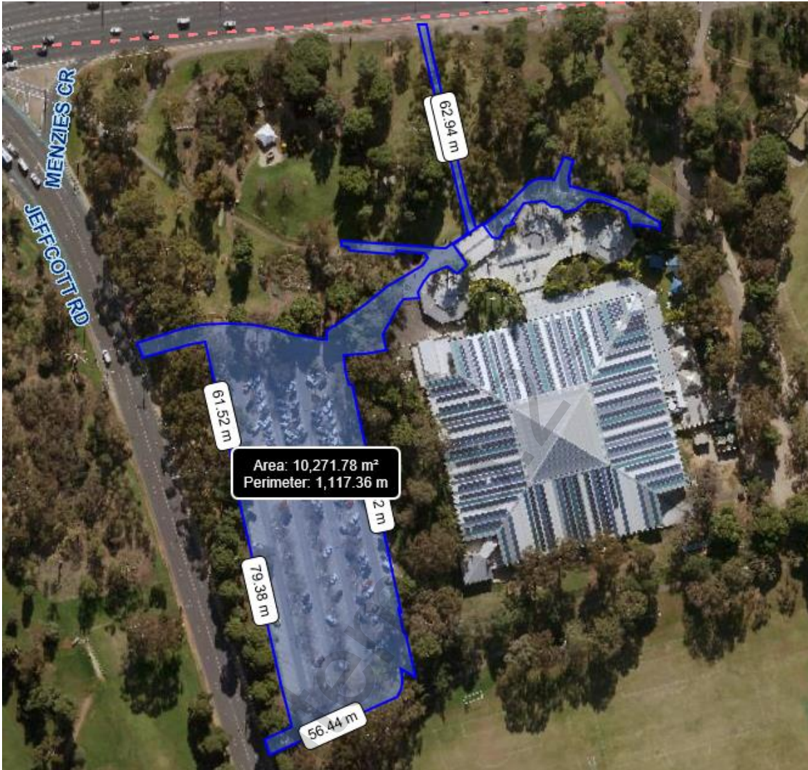
Image 3 - Square metres occupied by roadways, footpaths, paved and car parking areas that are separate to the built form of the current Aquatic Centre.